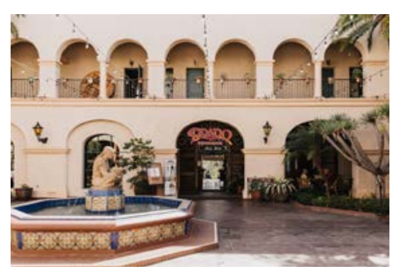
The Prado Wednesday's Welcome Reception