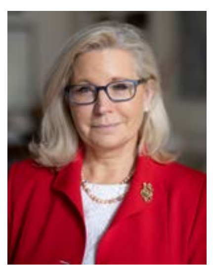
Liz Cheney U.S. Representative for Wyoming's At-Large Congressional District (2017 – 2023)