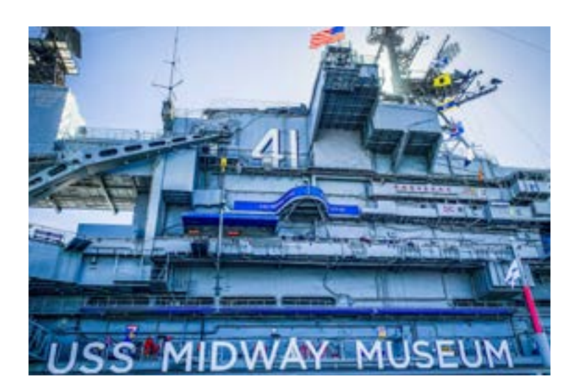
USS Midway Museum Friday Night's Reception